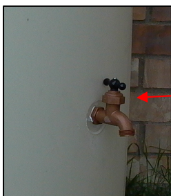
Deluxe model garden spigot with garden hose threads

insects, organic debris, and small animals. The RB80g is available with an optional strainer basket. An added feature of the Deluxe model rain barrel is that it will collect and store rain and melted snow in the wintertime without damaging the drain valve when the stored water freezes! The RB80g is warranted for one year. The RB80g is built with UV protection additive and is FDA approved for potable water.