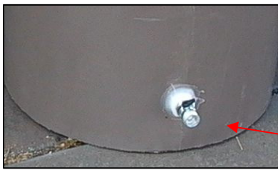
Deluxe model butterfly drain valve

The RB80g rain barrel has all of the essential elements plus extra features for effective rainwater collection, storage, and distribution. This rain barrel holds 80 gallons and has a reinforced “flat” back that fits nicely against walls. The RB80g rain barrel is available in two solid colors, Emerald and Dark Adobe. These rain barrels are decorative and will complement any home and landscape. Two models are available, the standard RB80g and the RB80g Deluxe. The Deluxe model has a butterfly drain valve in a durable brass housing with garden hose threads (GHT) at the very bottom that easily connects to a garden hose. The Deluxe model also has an Acetyl garden spigot that is 16 inches above the bottom. This allows one to